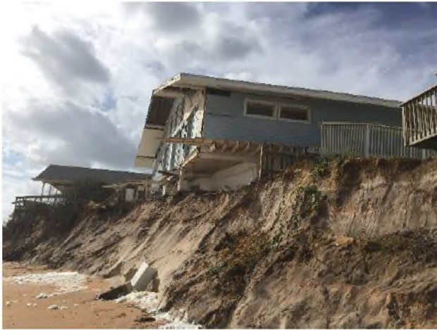
3171 N Oceanshore (Old A1A Partners)