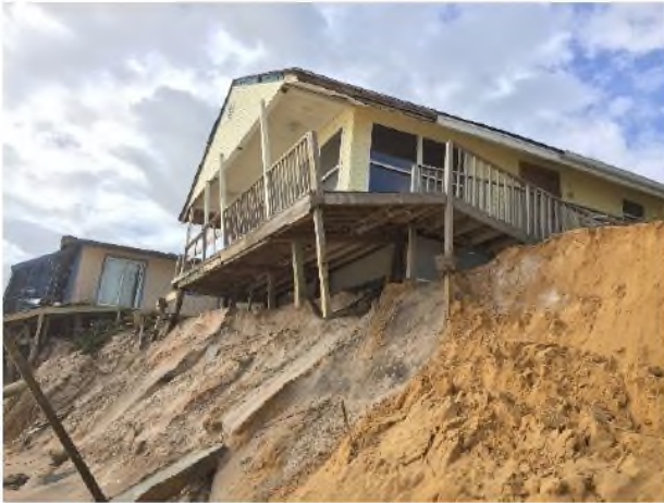
3189 N Oceanshore (Fitzgibbon)