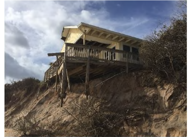
3167 N Oceanshore (Meuer)