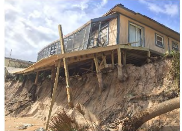
3183 N Oceanshore (Saunders et al)