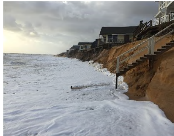
3195 N Oceanshore (Davis)