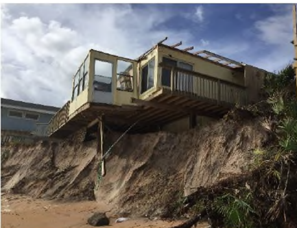
3179 N Oceanshore (Harper)